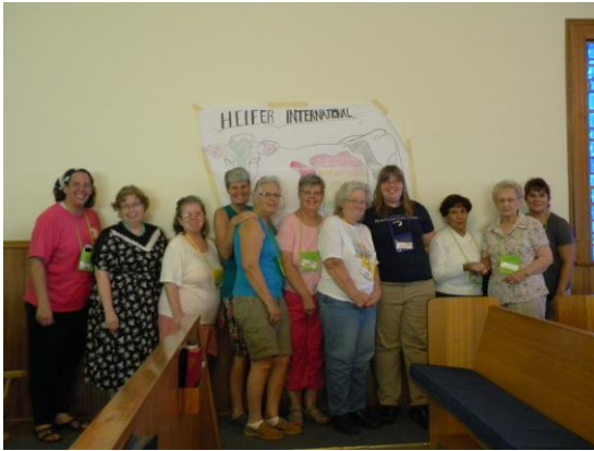
Vacation Bible School Leaders

Thursday 8/7, 1:30pm Dorothy Circle Saturday 8/16, 9:00am Men's Breakfast Sunday 8/17, 12:15pm Pastor Appreciation Day 8/24, 12:15pm Reunion Potluck