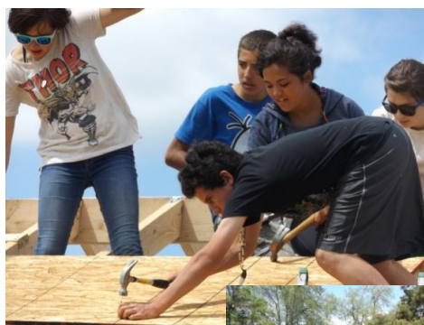
Mission Trip Photos!!