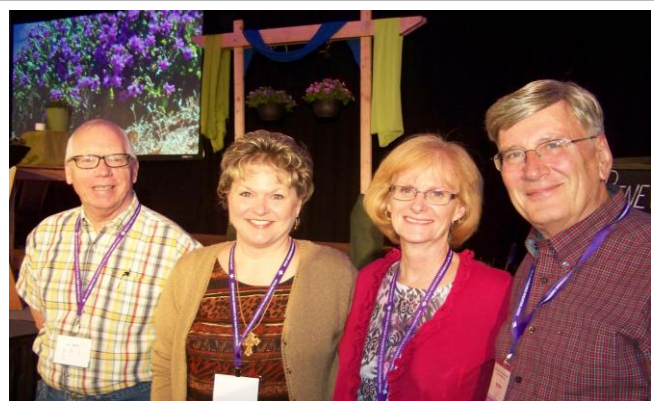
Sharps and Keetchs at Annual Conference 2015